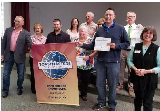
Rock Springs Raconteurs Charter Celebration in Rock Springs, Wyoming