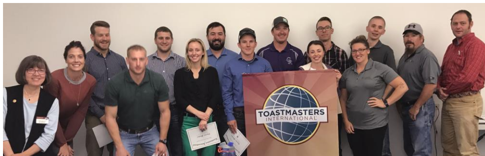
AP Toastmasters Charter Celebration in Aurora, Colorado

Saying yes. Stepping up. Doing the small things when asked. By doing these things, really means finding out what you are made of and becoming a leader. Remember when someone asks you, say yes!