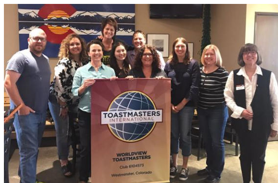
WorldView Toastmasters Charter Celebration in Westminster, Colorado