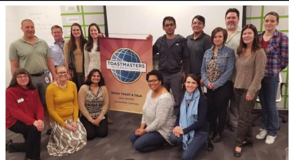
Gogo Toast & Talk March 7, 2017