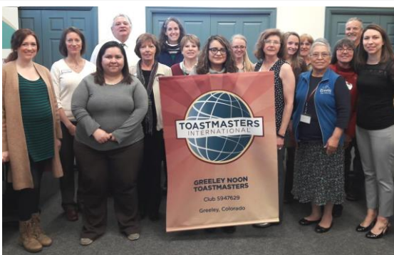
Greeley Noon Toastmasters March 2, 2017