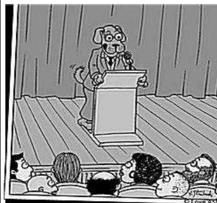
"I must admit that I've come a long way since I first heard the word speak!..."

NOT hold back until you have collected everyone's money. Submit dues for six (6) members ASAP to meet the DCP goal. ▪